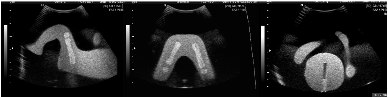
Femoral Length for Measurements