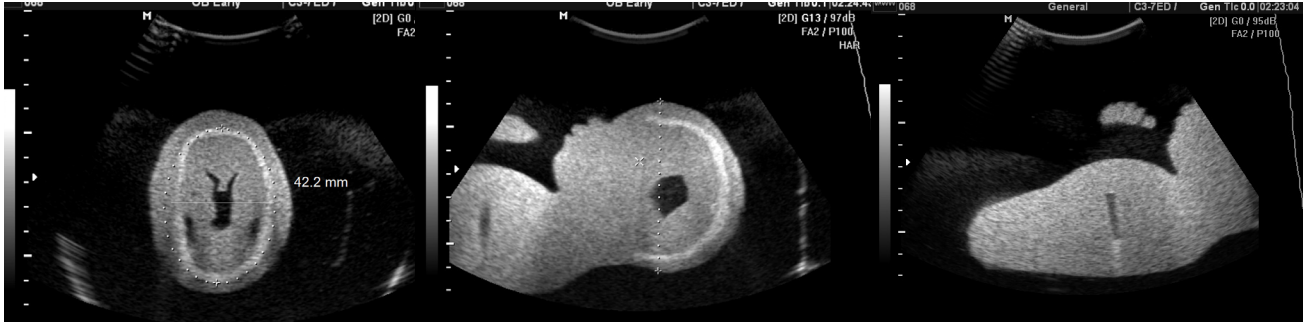
Axial Brain & BPD Measurement